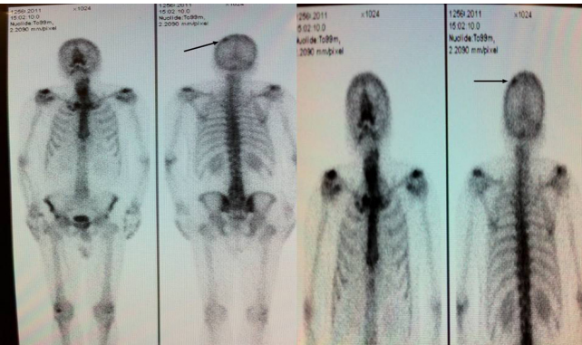
Figure 1. Bone scan demonstrates occipito-parietal bone metastases.

A 75-year-old man presented with only isolated serum prostate-specific antigen (PSA) elevation to our clinic. There was a history of hyperlipidemia, diabetes mellitus and cholecystectomy operation. Physical examination was unremarkable. The patient denied any urinary symptoms. Serum total PSA measured before digital rectal examination (DRE) was 23.13 ng/ml. Basic laboratory examinations of complete blood count, serum biochemistry, and urine analysis were normal except cholesterol and glucose levels. DRE revealed an enlarged, firm prostate gland. Transrectal ultrasound guided prostate needle biopsy was performed in this patient. The pathological examination revealed adenocarcinoma of the prostate (Gleason 4+4). Abdominal computed tomography (CT) scan and whole-body bone scintigraphy were performed in this patient. Abdominal CT scan revealed heterogeneous parenchymal density of the prostate and the other structures were normal. Bone scintigraphy revealed occipito-parietal bone metastases (Figure 1). There